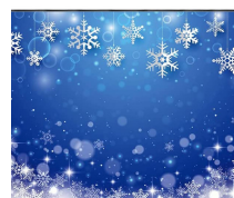
BLUE WITH WHITE SNOWFLAKE