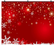
RED WITH WHITE SNOWFLAKE